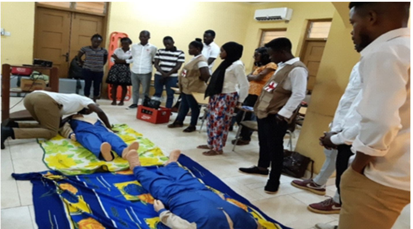
Team members going through CPR hands-on

The purpose of this retraining was to review and update participants on the overview of emergency response, fundamental principles, first aid in emergencies and others. This activity was supported by the International Committee of the Red Cross (ICRC)