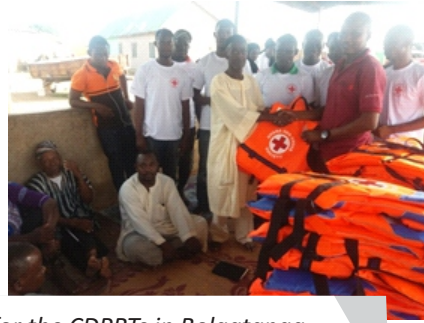
Presentation of materials for the CDPRTs in Bolgatanga.